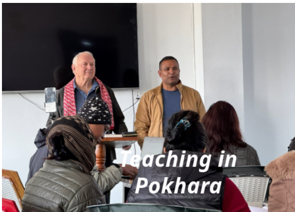
Teaching in Pokhara