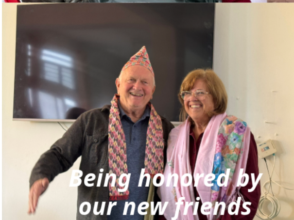
Being honored by our new friends